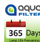
Lamp Life Remaining Screen