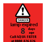
Lamp Expiration Screen