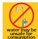
Unsafe Water Screen