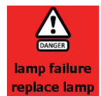
Lamp Failure Screen