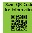
QR Code Screen