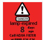
Lamp Expiration Screen