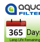
Lamp Life Remaining Screen