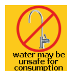
Unsafe Water Screen