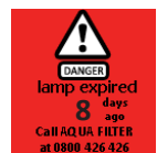
Lamp Expiration Screen