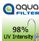
UV Output Screen